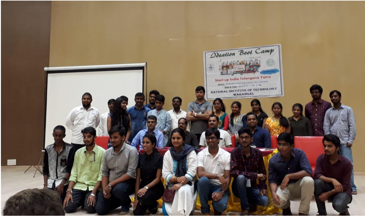
Start-up Yatra Shortlisted teams at NIT Warangal Boot Camp (22.09.2018)