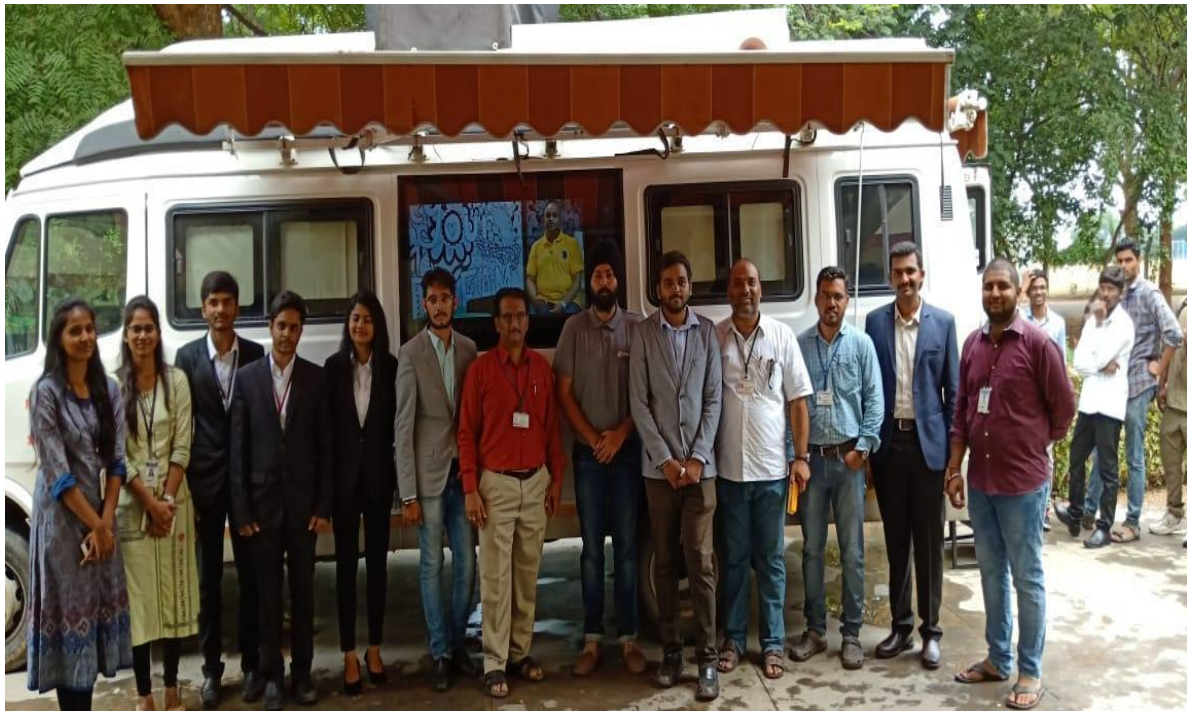
Start-up Yatra Shortlisted teams at NIT Warangal Boot Camp (22.09.2018)