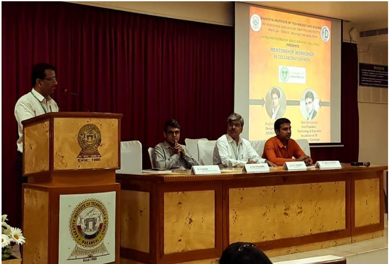
Inaugural session of Mentorship Workshop (31.01.2019)