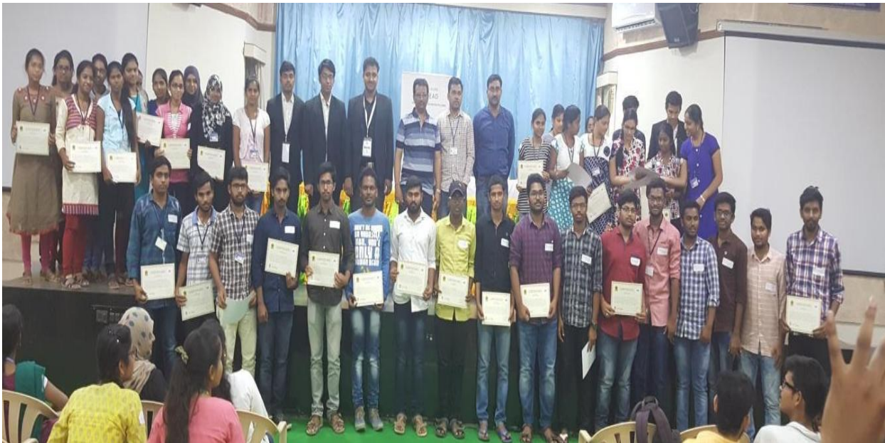
Valedictory function of iB-Hubs boot camp (11.03.2018)