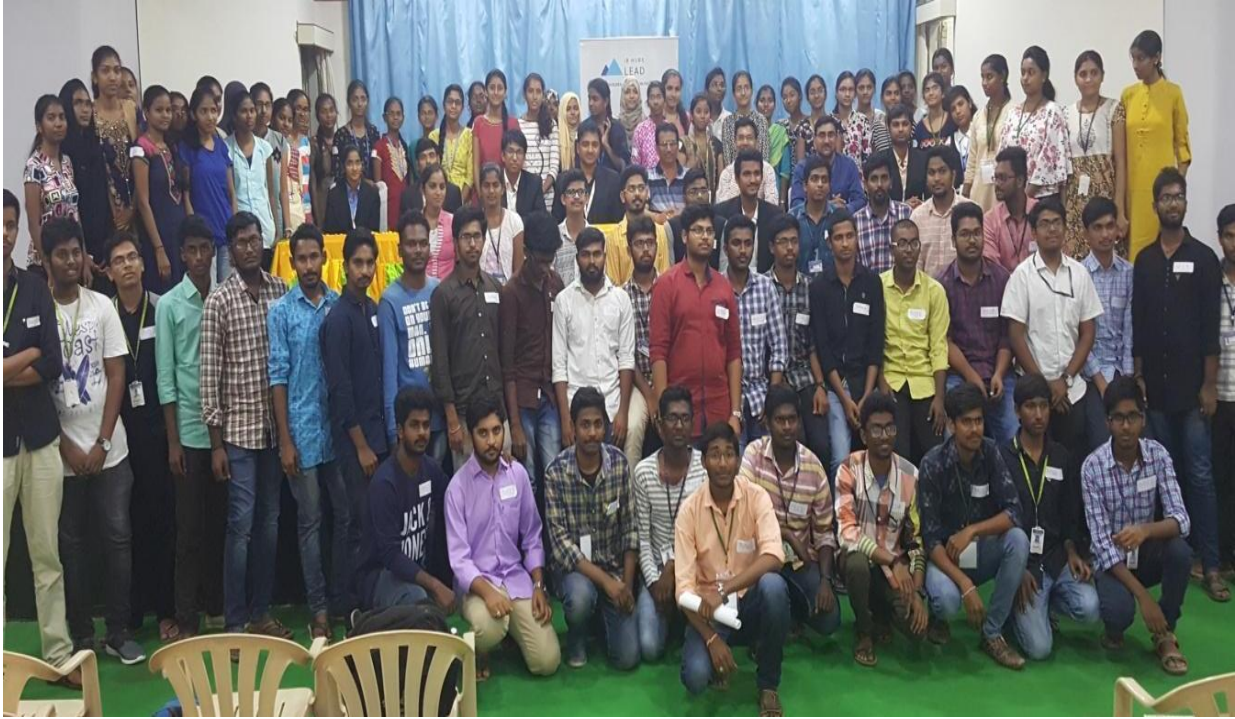
Valedictory function of iB-Hubs boot camp (11.03.2018)