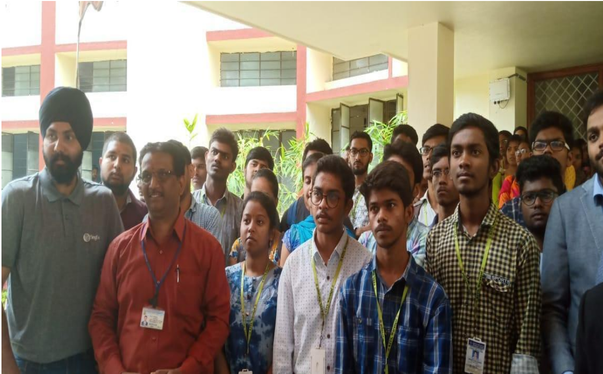
Start-up Yatra Van at KITSW (19.09.2018)