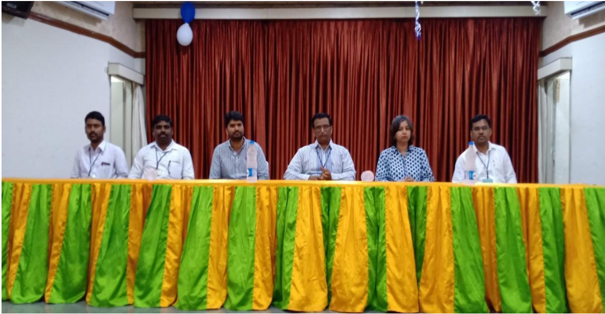
Inaugural function of ISB-TEP orientation programme (04.09.2018)