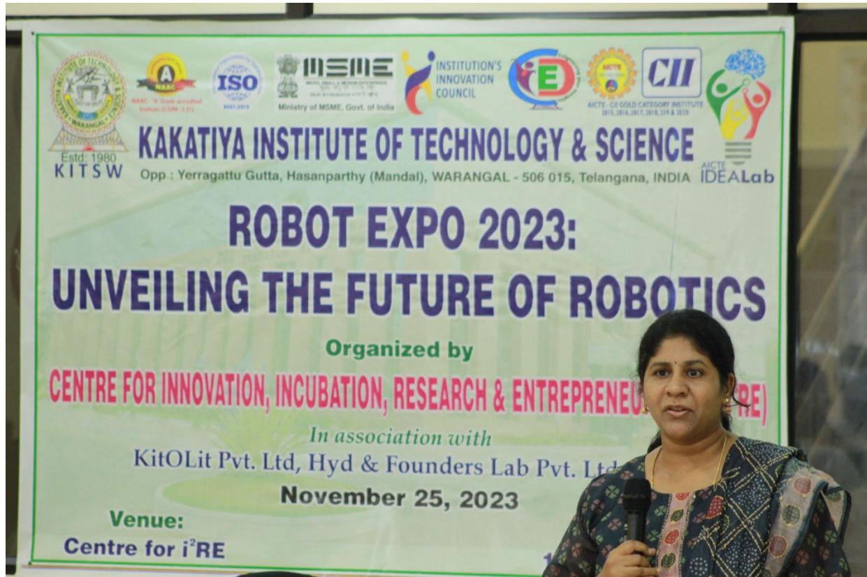
CEO-FOUNDER OF KITOLIT Explaining about their company