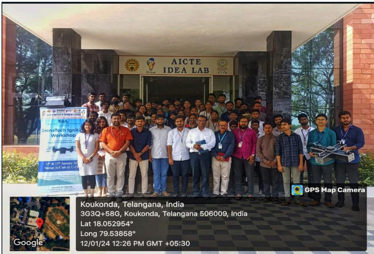
A picture with all the participants of drone tech ignition workshop.